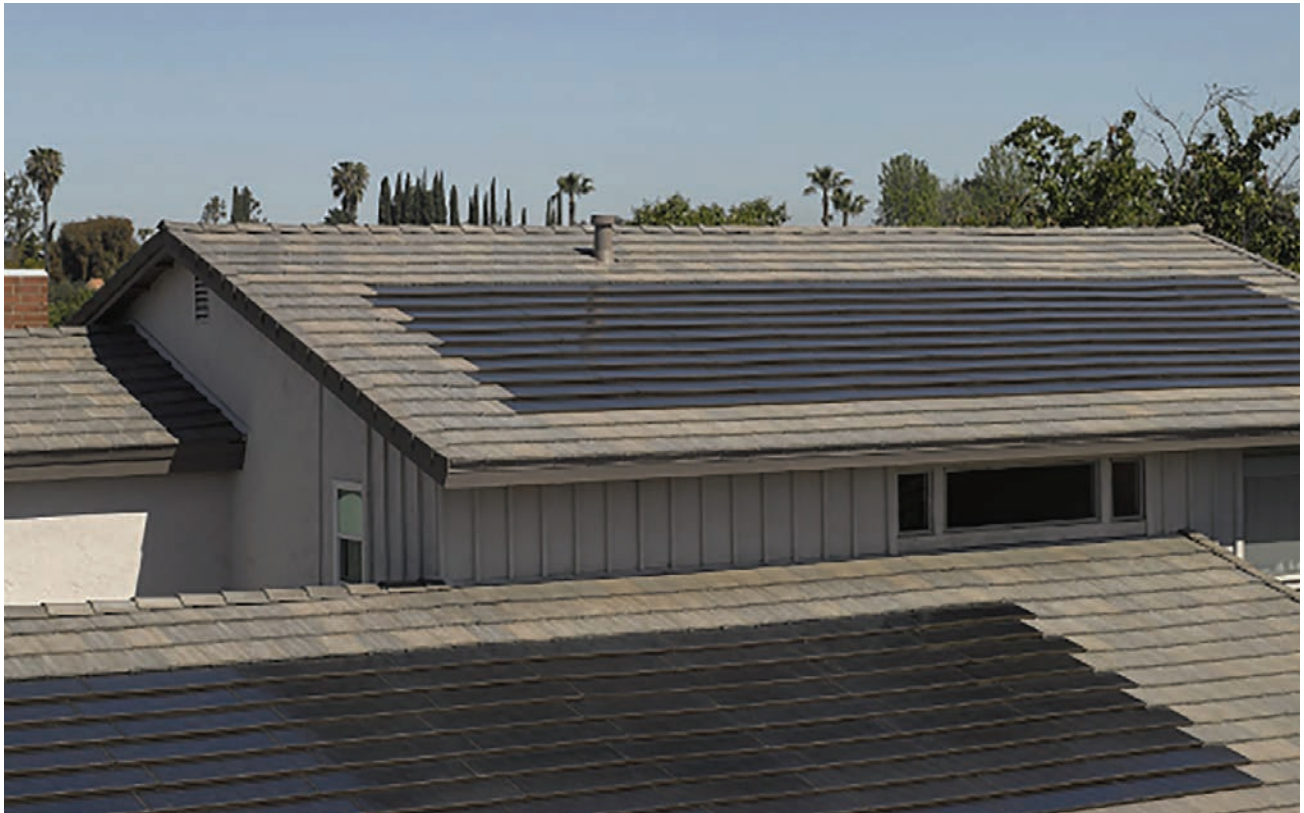
CertainTeed's Apollo II solar shingles

One company that is still trying the CIGS thin-film route is flexible panel manufacturer Sunflare. The company brought prototype four-cell solar shingles to Solar Power International 2018 and expects to have a finalized product by 2021 (as confirmed to Solar Power World ). It's unclear by looking at the prototype shingles whether the product would be installed with traditional roofing shingles or as a full roof, but Sunflare said it will focus on new roof installations.