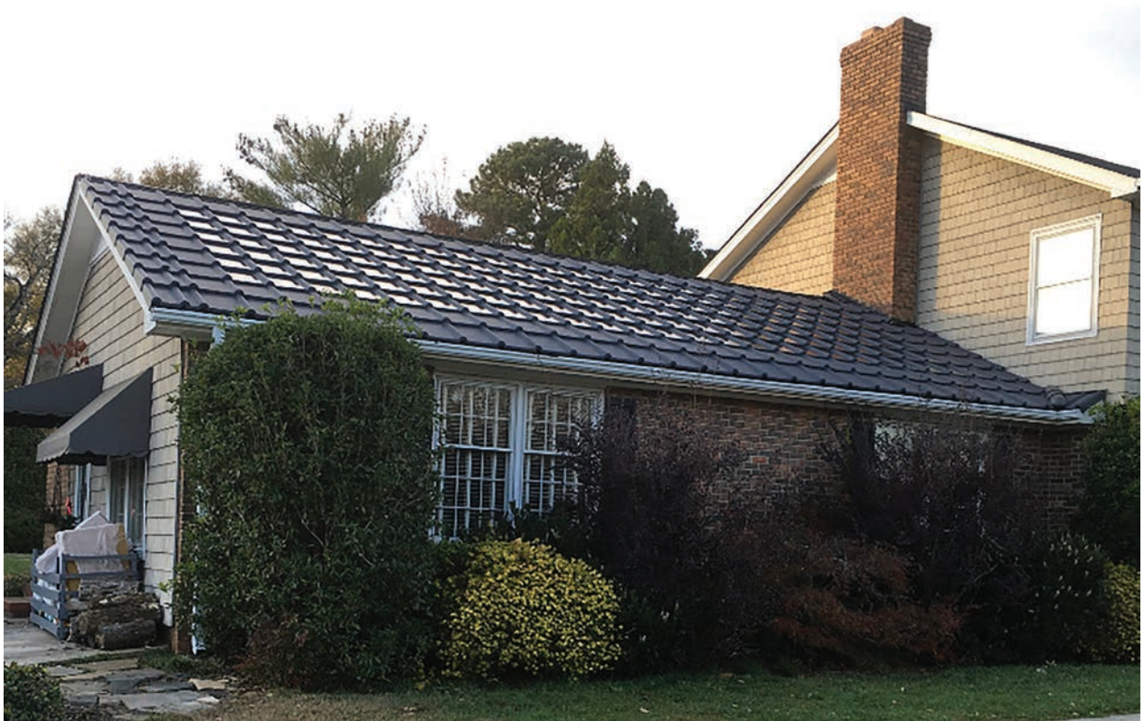
A DeSol Power Tiles installation.